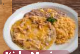
Kids Mexican Pizza