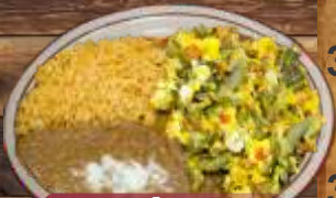
Nopales con Huevos

93. Huevos a la mexicana scrambled eggs with tomatoes, chopped onions and jalapeños.