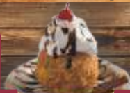
DEEP-FRIED ICE CREAM