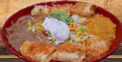
Combo #3 2 Flautas