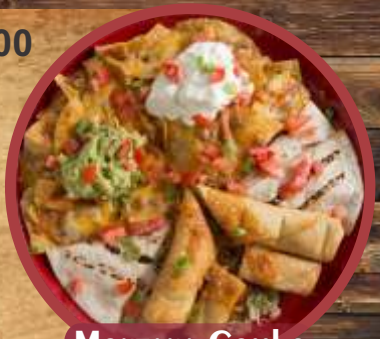
MONTANA Combo Appetizers

Nachos fries French fries with ground beef, topped with melted cheese, guacamole and sour cream $14.50