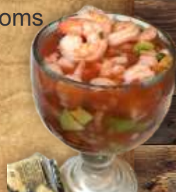
Coctel de CAMARONES