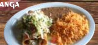
E) Taquitos Rancheros