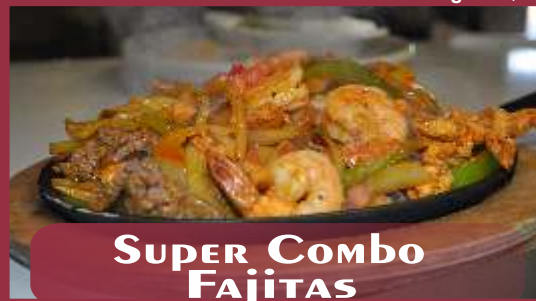
SUPER COMBO FAJITAS