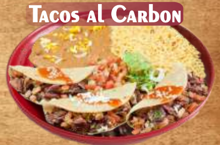
TACOS AL CARBON