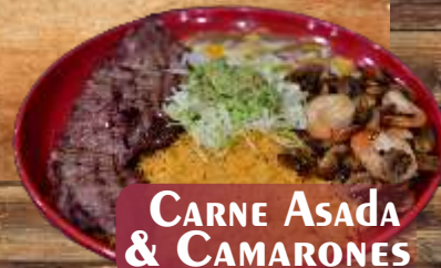
CARNE Asada & CAMARONES