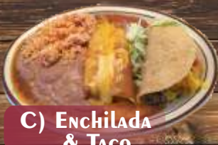
C) Enchilada & Taco