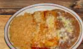
#5 2 Enchiladas