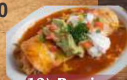
12) BURRITO MONTANA