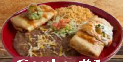
Combo #1 2 Chimichangas